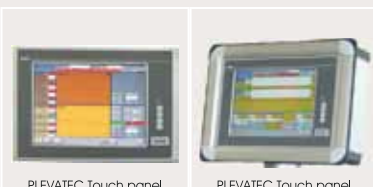
PLEVATEC Touch panel