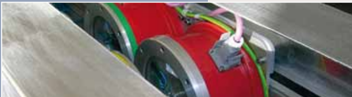
type SD1C - SD2C

The new high-resolution cameras with high-speed traversing frames allows advanced structure analysis, pick-course counting and width measurement on running fabrics.